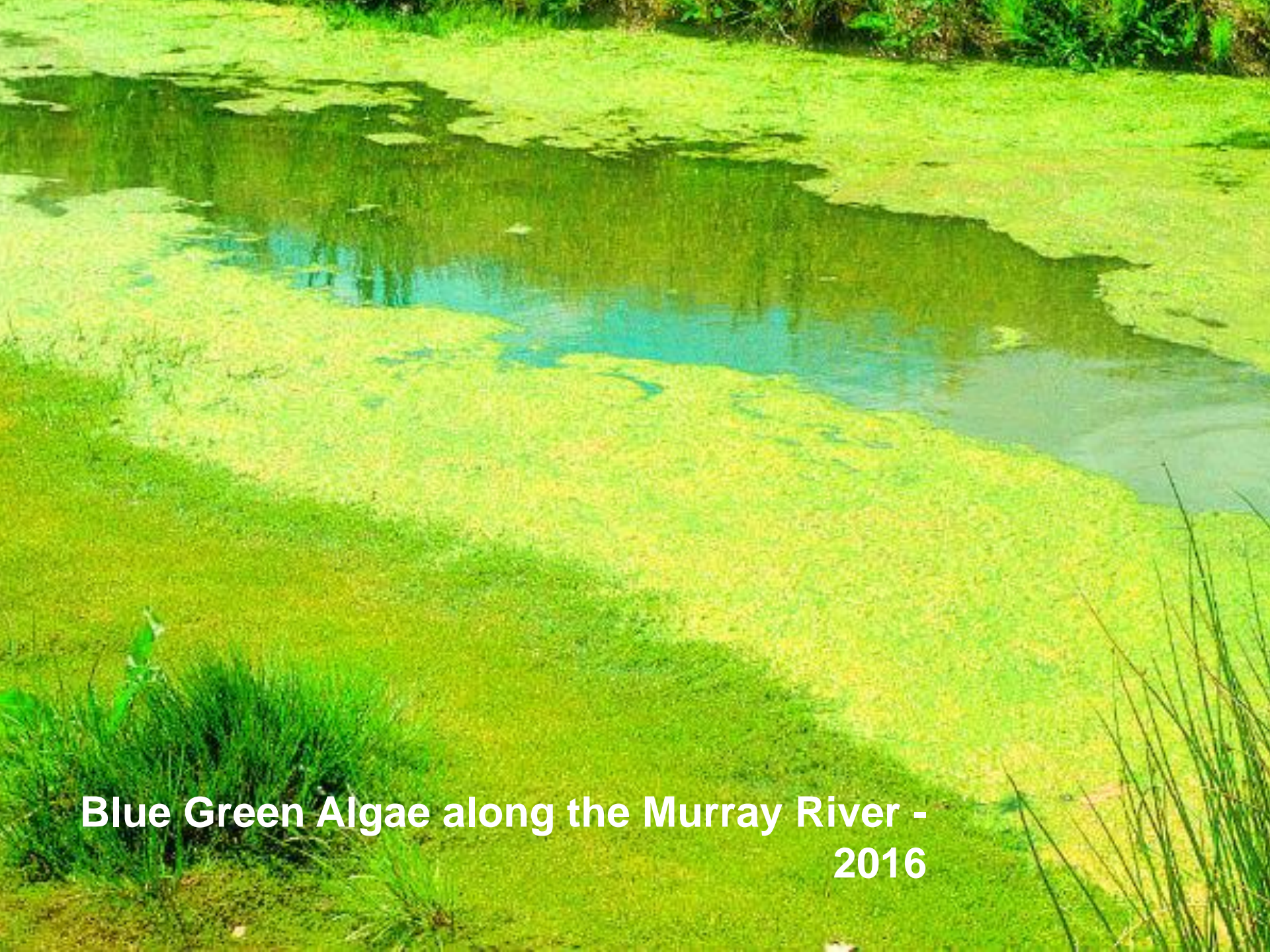
Blue Green Algae along the Murray River - 2016